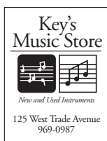
1/4 Page Layouts