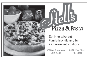
1/2 Page Layouts